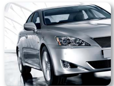
Flexi-Cell products used in the automotive industry and other market sectors