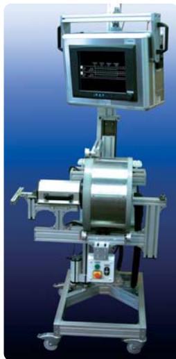
Pixargus precision measuring technology is used during the manufacturing process

As a supplier to the automotive sector, many of the controls and disciplines used within this industry have been applied to the other aspects of the Flexi-Cell business including: